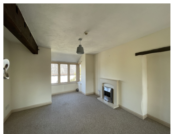
BEACON BUILDINGS, KENDAL.